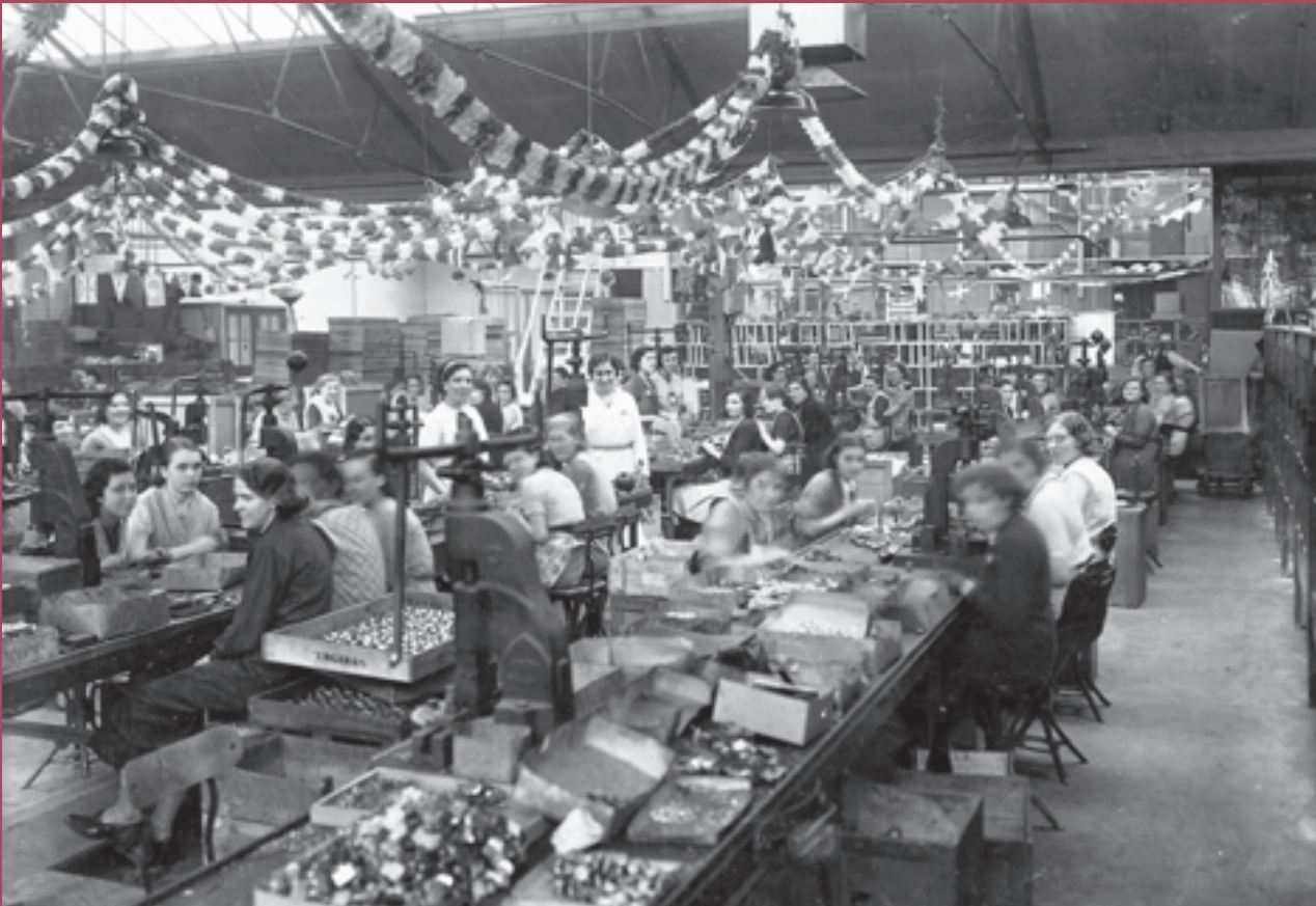
Wells Brimtoy factory decorated for the jubilee

Saturday 19 October 2013 – Sunday 23 February 2014