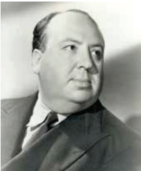
Alfred Hitchcock was born in Leytonstone

All proceeds go to supporting the Walthamstow International Film Festival