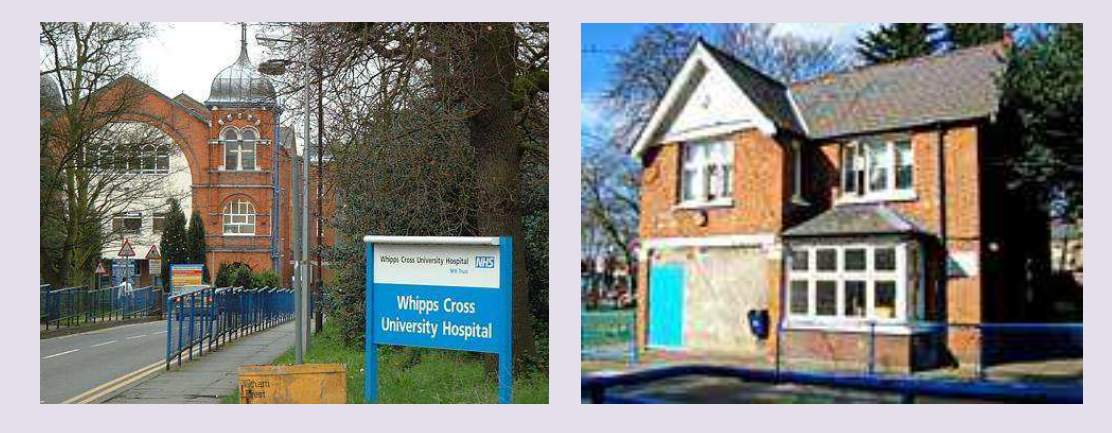
Left: The main entrance from Whipps Cross Road

In November 1955, the Hospital had 974 general medical and surgical beds. Nightingale Ward was opened as an additional surgical ward. A new Medical Records Department was set up in C.2 Ward and Wards D.5 and D.6 were converted into a new Physiotherapy Department at a cost of £320.