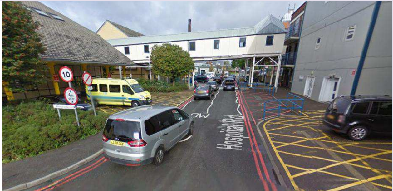
Above: The bridge joining the 'old' hospital to the Outpatients part of the Plane Tree Centre

In 1995, the Plane Tree Centre opened for the provision of day surgery.