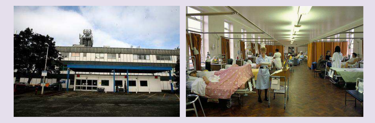
Above Left: The Maternity Unit