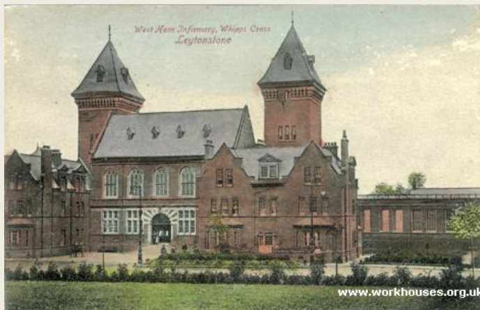
Above: view of the entrance to the administrative block in 1904

The kitchen lay immediately behind the main corridor of the main administration block, off of which, right and left, were the Medical Superintendent's office, Matron's rooms, nurses' and probationers' rooms, dining rooms, workrooms and storerooms. Behind the kitchen were the sculleries and the servants' hall.