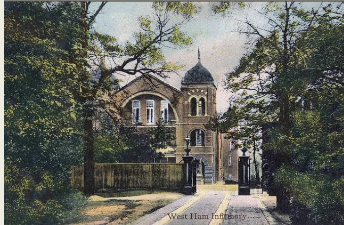
Above: Entrance to the hospital

Receiving wards, each with its own bathroom, were located on either side of a large entrance hall - the one on the right for men and the one on the left for women. Corridors connected the wards to the residences of the Medical Superintendent and the Assistant Medical Officers.