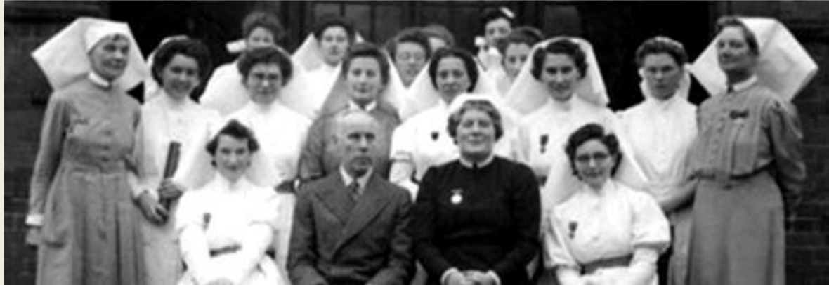
Above Some hospital staff in WWI

During WW1, in 1917 part of the Infirmary became the Whipps Cross War Hospital. It was affiliated to the Colchester Military Hospital and 240 beds were given over for wounded and sick servicemen. During the war some 6,000 injured soldiers were treated at the hospital.