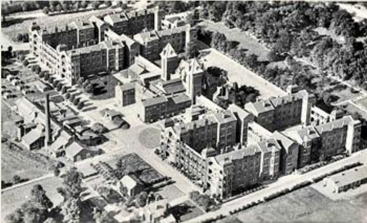
Above: an aerial view of the hospital in the 1930's

In 1930, the Boards of Guardians were abolished and control of the Hospital was taken over by West Ham Borough Council. The Council added new ward blocks and,