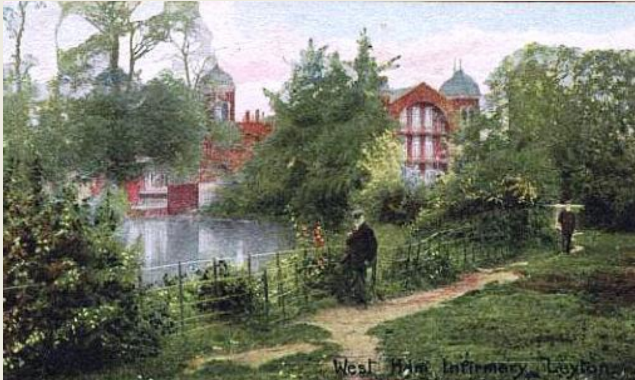
Above: view of the rear of the hospital

The four symmetrical ward pavilions - two on either side of the administration building (the ones on the right for men and those on the left for women) - contained 672 beds. Ward Block A consisted of six wards of 24 beds each and 12 isolation wards of two beds each. Ward Blocks B, C and D were identical; each contained 168 beds. Access to the wards was through an entrance lobby from the small central administration ward block, which contained a stairway, lifts and utilities. Each Ward Block had two lifts - one for patients and the other for food delivery (three other lifts in the Infirmary were service lifts). At the entrance to each large ward were two isolation wards, a nurses' duty room, a Day Room for the patients and a linen store.