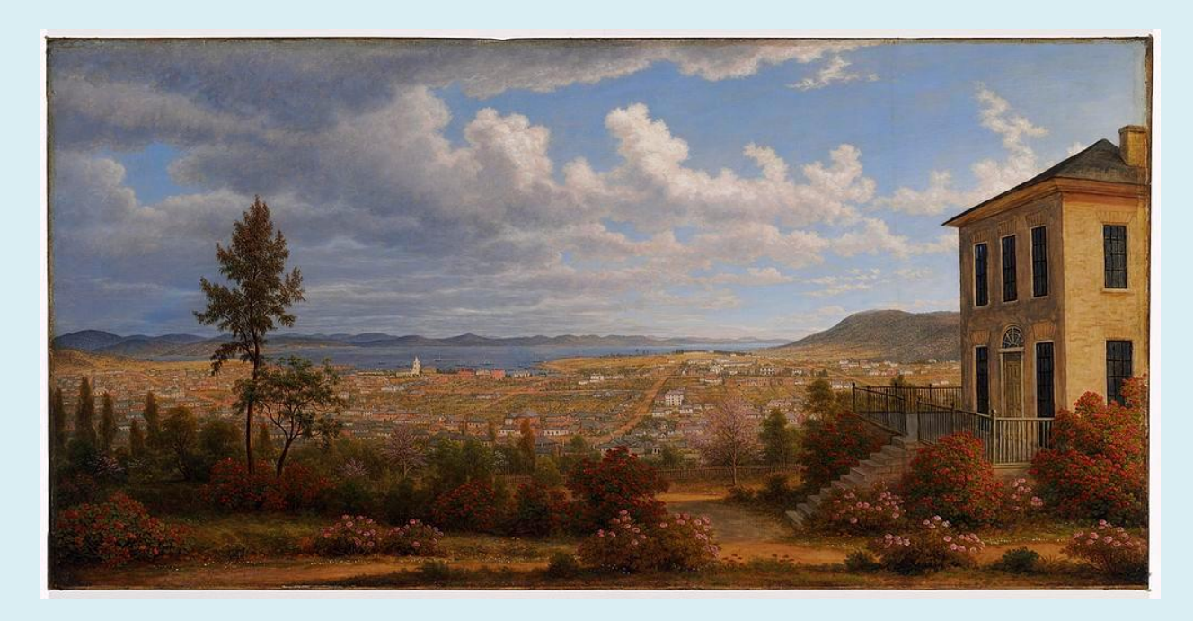
Painting of Hobart, Tasmania, Australia, in 1832 by John Glover.

who had soon turned Hobart into a thriving port. The docks were busy as the Navy shipped materials such as timber, flax and rum from Hobart Town. It had become a vital Southern ocean re-supply stop for international shipping and trade, and a major freight hub for the British Empire. Wealth poured into the port on the back of this trade.