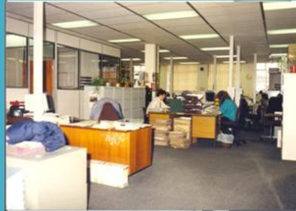
Top – Wood Shop, Bottom – Office

In 1999, Hammon & Champness effectively was absorbed into ThyssenKrupp along with the rest of the Dover Corporation elevator business. ThyssenKrupp is a German multinational conglomerate corporation based in Duisburg and Essen, Germany. The corporation consists of 670 companies worldwide. While ThyssenKrupp is one of the world's largest steel producers, the company also provides components and systems for the automotive industry, elevators, escalators, material trading and industrial services.