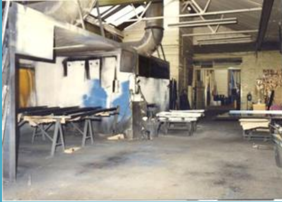
Top – Work Entrance. Bottom – Paint Shop